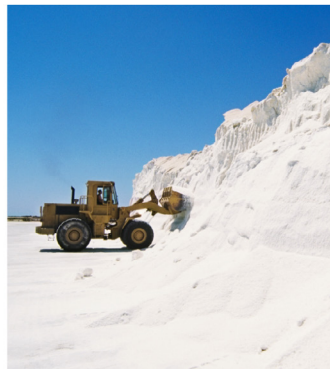
ROAD SALT INVENTORY TRACKING & DISTRIBUTION