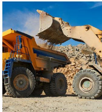
OPTIMIZE MINE & QUARRY OPERATIONS